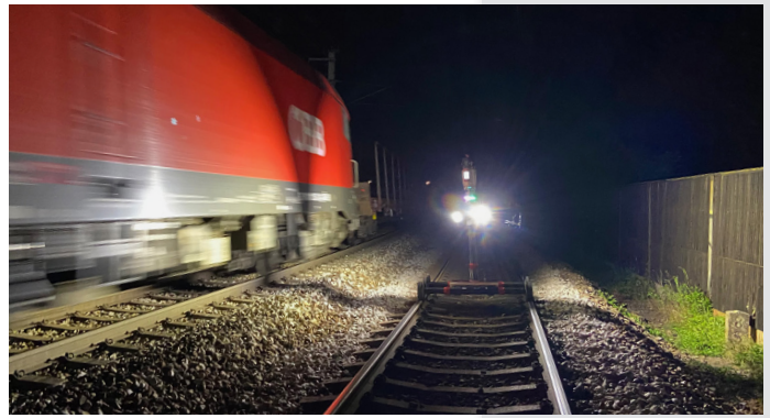
optional lighting system with 4 LED lights