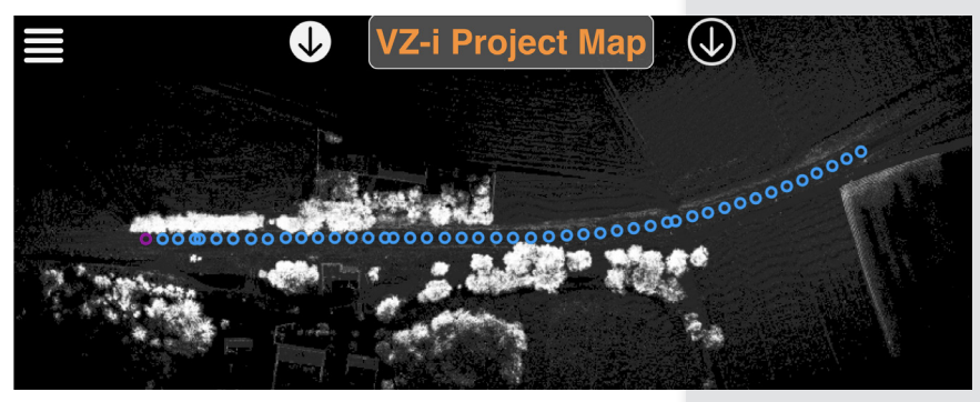
While the scanning platform is still working in the field, the operator can check the registered scan positions and scan data from a remote position via mobile device.