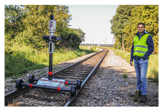
RIEGL VMR: data acquisition in Stop & Go mode at the test track in Lower Austria

project supported by Dr. Döller Vermessung ZT GmbH www.doeller.biz