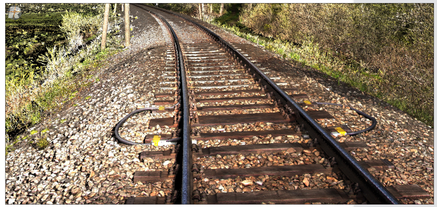
true-colored point cloud acquired in RiSCAN PRO