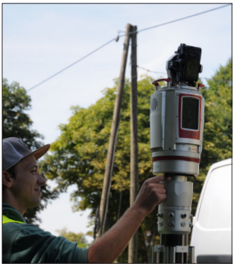
quick release adapter for convenient mounting of the scanner