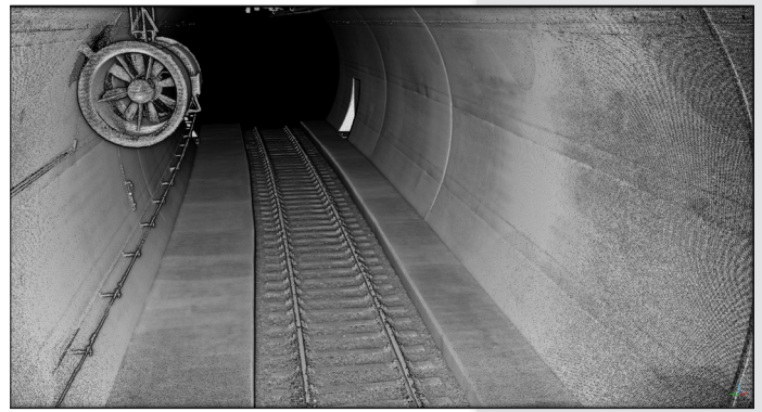
arev-scaled point cloud of subway tunne

In Stop & Go mode, the VMR system stops every 7 meters to take more than 20 million measurements with millimeter precision in one minute. The system can be operated with a maximum speed of 1.5m/sec. Thanks to the stable integration of the scanner in the robotic platform, the consistent central position on the track, and the regular distance of the scan positions, the resulting point cloud provides excellent homogeneous point density distribution.